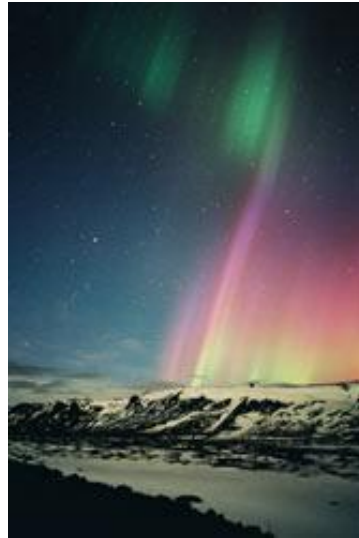
The Northern Lights – Iceland

sins/sorrows/darkness of each of them can be made full so that they too may enter into perfection and Light. It is interesting to note that in Iceland the 'Light' literally does shine in the darkness in the form of the Northern Lights, a spectacular display in the skies, and furthermore when you look at wintery Iceland from space it is easily distinguished as a light beacon in the surrounding darkness.